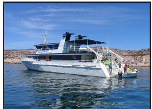
The MV Narval at anchor.