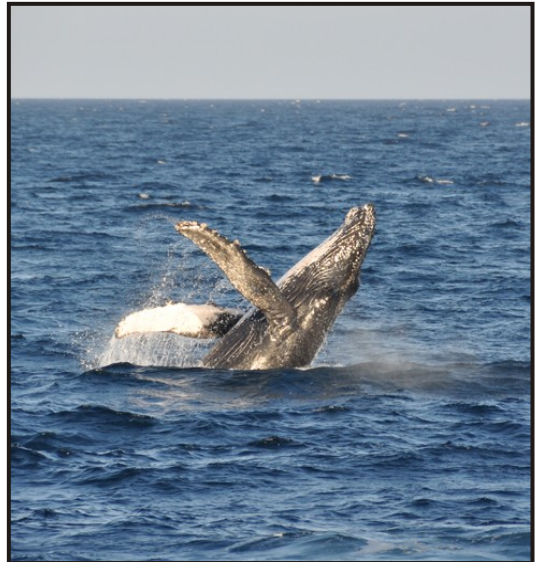
Breaching Humpback whale.