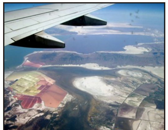
Aerial view of the basin of the Sea of Cortez