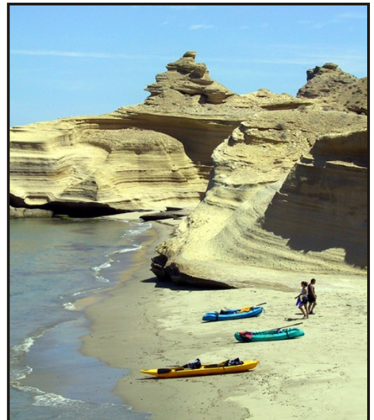
Kayaking to Fossil Beach.