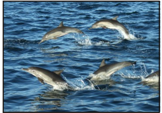
Encounter with a pod of Common dolphins.

During the month of April the average temperature in the Sea of Cortez ranges from 22-26° Celsius (72-79° f). In the Baja the days are warm and beautiful, however the evenings cool down and often require light pants and a jacket. The water temperature ranges from 18-22° Celsius (65 - 72° f) and can be surprisingly cool. It is not the tropical temperatures one would expect.