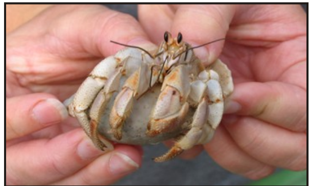
Who's checking who out!

For more information or to book your spot on the expedition please contact: