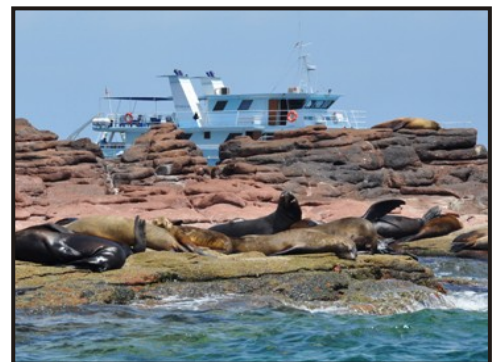
The MV Narval at Los Isolotes. Breeding grounds of the California sea lions.