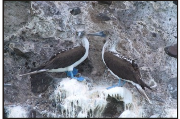
A pair of Blue-footed Boobie birds.

If you would like more information on the ship, the MV Narval, please go to our website and click on the heading "Adventure Travel With a Purpose" then scroll down to the bottom of the page and click on "MV Narval - Ship Information"