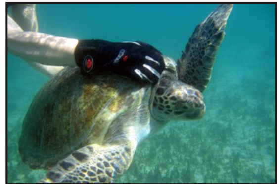
A Green Turtle is released after being weighed, measured and tagged as part of a Turtle Monitoring program.