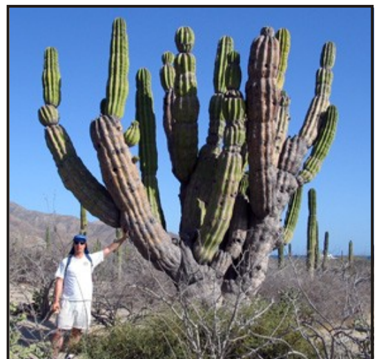
Exploring a cactus forest.