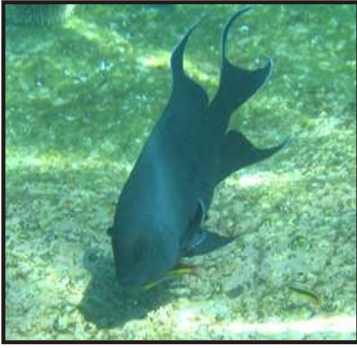
Damselfish feeding on algae.

SNORKEL in shallow, crystal clear waters and observe the amazing diversity of undersea life. If your group participates in the whale shark research, you'll be snorkeling with them!