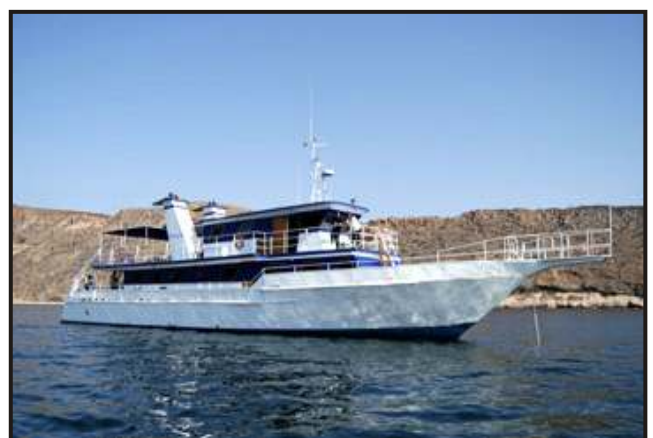
The MV Narval (117') at anchor.

SHIP INFO - The "MV Narval" is a 117' steel hull ship. As a certified passenger vessel, all crew, vessel paperwork, safety and navigation equipment meet the legal requirements under the "Nacional de Seguridad Maritima" laws. The multiple level decks are ideal for wild-life viewing and accommodations are private staterooms with single berths, double/quad occupancy. Each stateroom comes complete with full bathroom facilities.