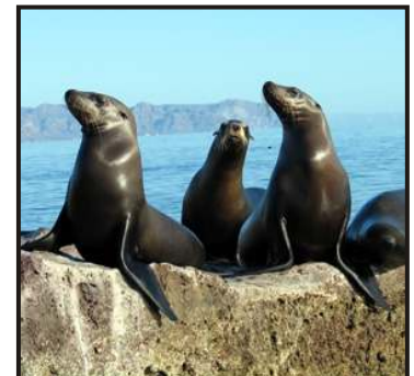
California sea lion haulout.

DESERT ISLAND NATURE HIKES take you on adventures through many different environments. Meander through cactus forests observing native plants and their amazing adaptations to the harsh environment. Take a walk back in time as layers of fossilized rock beds reveal the area's geological past. Visit an actively mined salt bed where the local fishermen produce salt to preserve the day's catch. Beachcomb along miles of white sandy beaches identifying bones, shells, and other treasures washed up on the beach.