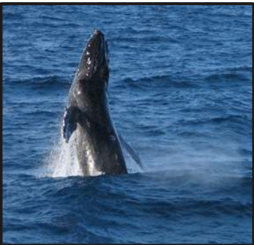
Breaching humpback whale.

MARINE LIFE ENCOUNTERS - Observe and interact with, in their natural environment, some of the largest whales on earth. Species encountered may include Blue, Finback, Sperm and Humpbacks, to name a few of the most common.