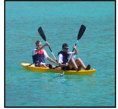
An afternoon kayak.

KAYAK through mangrove lagoons, over coral reefs, and in quiet bays. The kayaks are amateur "sit-on" type boats that are made of heavy duty plastic and requiring no previous kayak experience. They should not be confused with the professional sea-going type.