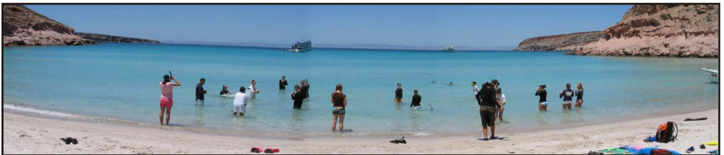
The ultimate outdoor classroom.

Anticipate encounters with whales, sea lions, seabirds and an amazing diversity of undersea life. Explore the geology of a desert island. Assist in a sea turtle monitoring program or help a scientist with her whale shark research; all of these activities are designed to make the science textbooks come alive. The Young Naturalist Expeditions are the result of many years of experience introducing students to the natural wonders of the marine environment.