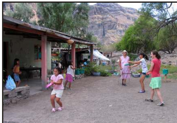
Students from Meadowridge School distribute their gift bags and then take a moment to play with the kids and their new toys.

If you would like to learn more about the "Journey to the Sea of Cortez" program, viewing the places we visit, the marine life we encounter and the kinds of activities we will be involved in, you are invited to browse through the "Daily Journal - Sea of Cortez" section of the Panterra website. Past participants have compiled these photo journals as part of the program curriculum. Our website address is www.panterra.com .