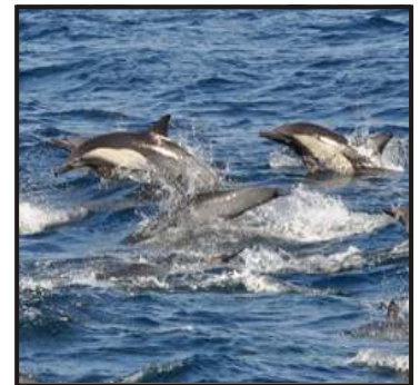
A pod of Common Dolphins.