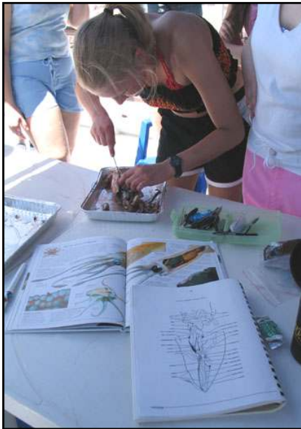
The dissection of a squid after finding several washed up on the beach. Do you know squid have three hearts?

For over 20 years the PANTERRA group has specialized in programing that introduces participants to the marine environment. Our goals are to impart a knowledge and awareness of the earth's natural history, demonstrate environmental conservation through educational endeavours, enrich the lives of youth by building valuable life skills and inspire an interest in further learning.