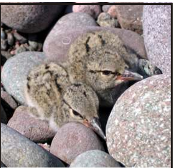
Oyster Catcher chicks.