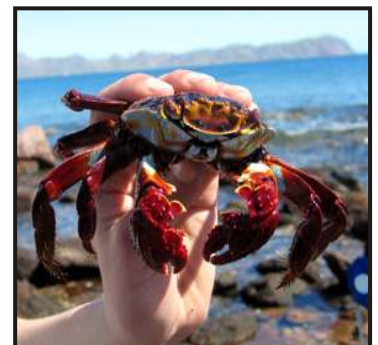
Low tide exploration - SL crab.

Explore a low tide, where life beneath the sea is exposed for a very short period of the day, revealing some of the most bizarre, yet beautiful marine life.