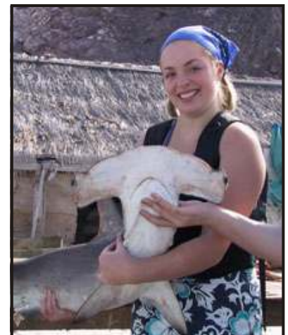
Hammerhead shark caught by the local fishermen.

Left in the wake of the collision was an explosion of natural geological wonders; a group of desert islands. The area has remained uninhabited, spellbinding and timeless. This amazing Galapagos type setting plays host to some of the rarest and most beautiful marine life encounters possible.