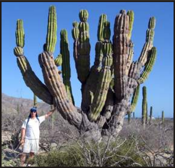
Hike through a cactus forest.

DESERT ISLAND NATURE HIKES take you on adventures through many different environments. Meander through cactus forests observing native plants and their amazing adaptations to the harsh environment. Take a walk back in time as layers of fossilized rock beds reveal the area's geological past. Visit an actively mined salt bed where the local fishermen produce salt to preserve the day's catch. Beachcomb along miles of white sandy beaches identifying bones, shells, and other treasures washed up on the beach.