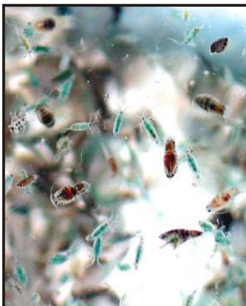
Planktonic marine organisms collected during a nightlight study session.